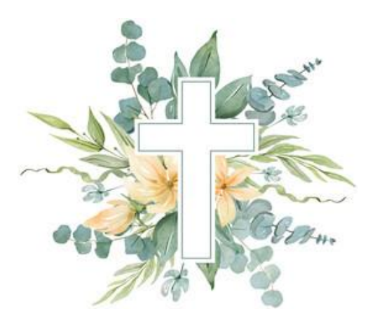
Please join us as we celebrate the 20<sup>th</sup> Ordination Anniversary of